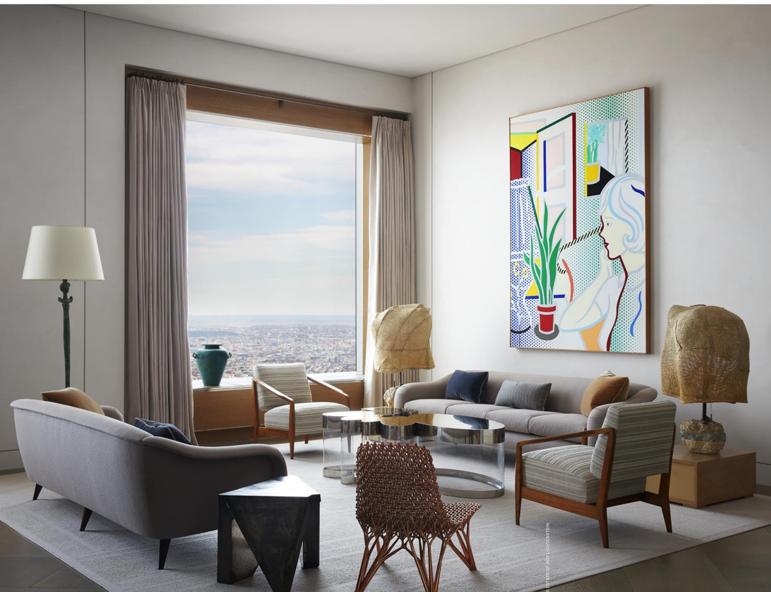
ON ONE SIDE OF THE LIVING ROOM, THE ENSEMBLE INCLUDES JOAQUIM TENREIRO SOFAS COVERED IN PRELLE SILK, A VINCENZO DE COTIIS SIDE TABLE, A GUY DE ROUGEMONT COCKTAIL TABLE, A JORIS LAARMAN COPPER CHAIR, NACHO CARBONELL TABLE LAMPS, AN ALBERTO GIACOMETTI FLOOR LAMP, AND CLAREMONT SILK CURTAINS. PAINTING BY ROY LICHTENSTEIN.