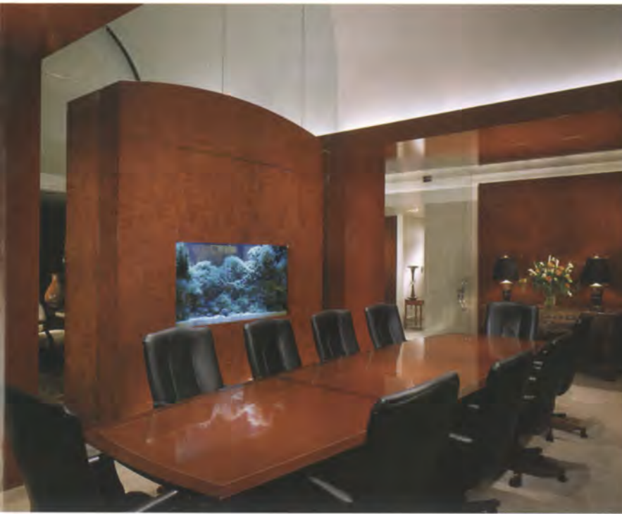
Providing unique woods and veneers is part of the service Merritt gives its customers. For the offices of Wall Street Capitol in Charlotte, NC, (left) Merritt used mottled and quilt-figured kewazingo in casework that contains a 300-gallon saltwater aquarium. The feature wall, pilasters, columns and soffits use fiddleback makore with 1/4-inch reveals. The boardroom table has a polyester resin finish with marquetry inlays and concealed custom power and data interfaces.