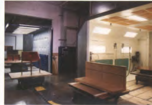
A variety of projects wend their way through Merritt's finishing room, which is equipped with a conveyorized cart system, three stages of ovens and a flash tunnel by Koch.

Huntington Bank and Paine Weber. The company also has completed projects for the Metropolitan Museum of Art and The 21 Club in New York City, and The Lodge at Vail in Vail, CO.