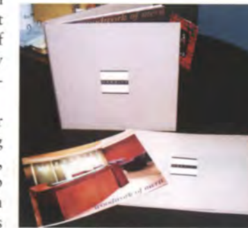
Merritt conveys a high-quality image to its clients with classy materials such as a fabric-bound book and individual brochures which showcase its projects.

"This is a small market and not a mass mailing situation," says Merritt. "We have definitely seen results from these collaterals. We have gotten responses from higher levels in the companies that we are pitching to, and these materials have opened new doors for us." ■