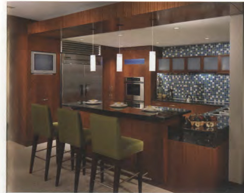
Quartered sapele wall panels in a herringbone pattern were used throughout the Cleveland, OH, offices of Shaker Investments Inc., including the staff dining area.

"First, we have a higher ratio of engineers and project managers on our staff as compared to other sub-contractors for the trade," Merritt says. "Also, we tend to create situations where a small group of our people works closely together on a project over a long period of time. This builds a sense of cohesiveness that you don't always see in the work place. In addition, we only have one shift working on a job. We can't risk the potential for error that could arise if we had a second crew coming in at three o'clock in the afternoon to take over where another team leaves off."