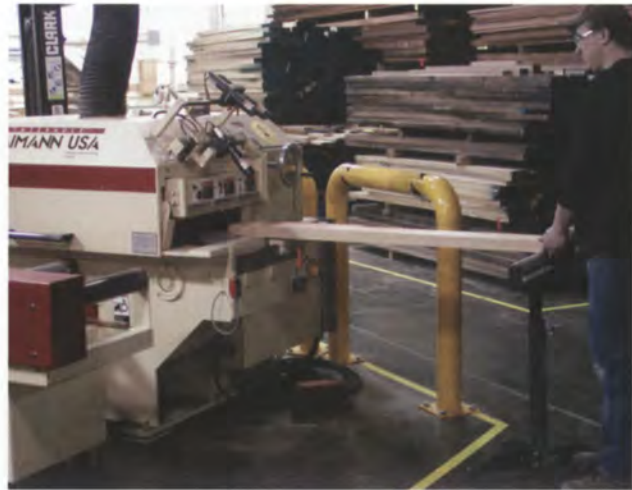
An employee runs a board through a Raimann computerized, laser-guided gang rip saw.

"We have no aspirations to be bigger than anyone else. We are interested in profitability, thus providing security to all our